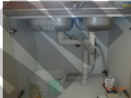
Damaged cabinets; sink leak