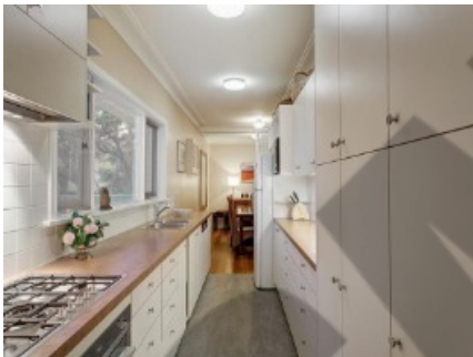
Rangehood exhausts into roof space