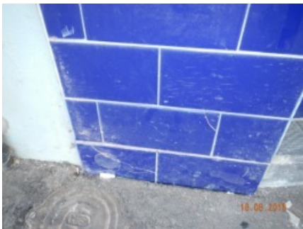
Building on front boundary - No access