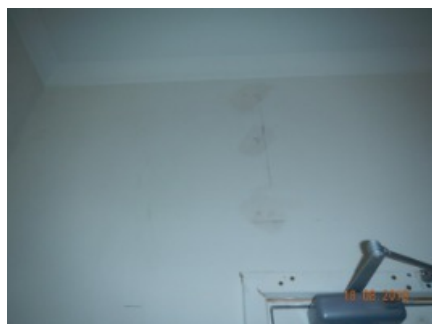
Wall affected by dampness - downpipe leak