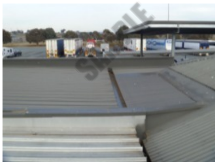
Recommend cleaning box gutters