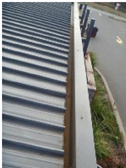
Recommend cleaning box gutters