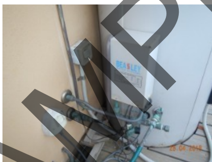
Recommend service check of hws