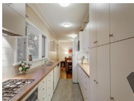
Rangehood exhausts into roof space